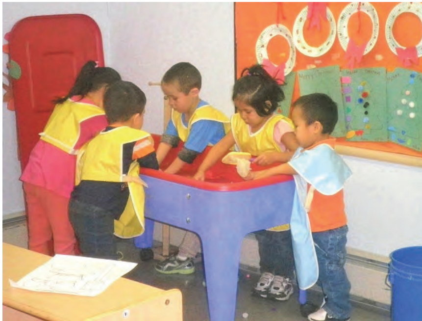
Bethel Head Start children.