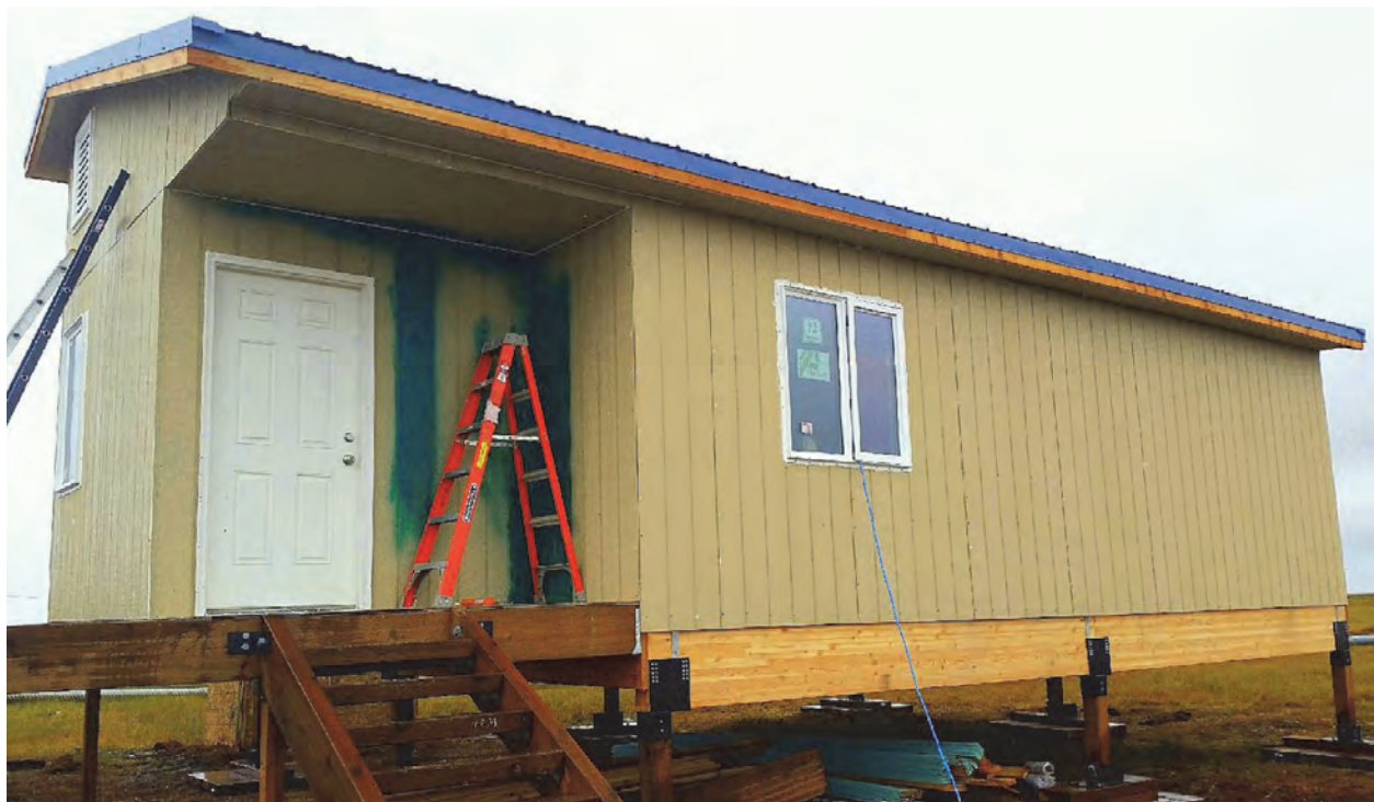
Nunapitchuk's PSB/VPSO Building

This year we will be working on a VPSO Public Safety Building and HIP Home in Nunapitchuk. Both building panels have been completed and will be shipped on the first barge to Nunapitchuk in May. I will have local workers work on both buildings and will send out a site supervisor to make sure the buildings are constructed correctly.