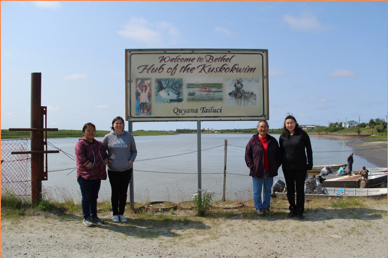
Pictured: Participants of the July 14 & 15 2021 New Hire Orientation. This was the first in-person New Hire Orientation since February 2020!

AVCP New Hire Orientations consist of a review of the AVCP Handbook, guidelines, and presentations on the variety of departments and projects of AVCP. The purpose of the orientation is to have new employees introduced and informed of their new work-place, as well as giving them a chance to ask clarifying questions on the topics at hand.