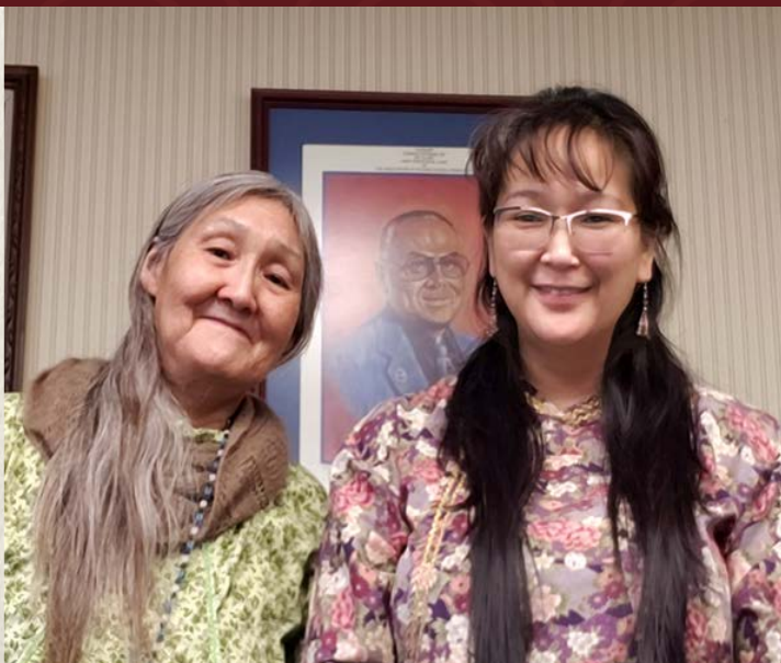
Qaspeq Friday photos on social media @avcpalaska